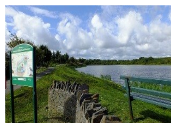
Little Lane Car Park .

We are delighted to announce that we have been given this prestigious award in recognition of all the hard work that has been carried out on the site by a small group of directors and members, so that the community can continue to enjoy the ever-improving facilities within the Ponds & Woodlands.